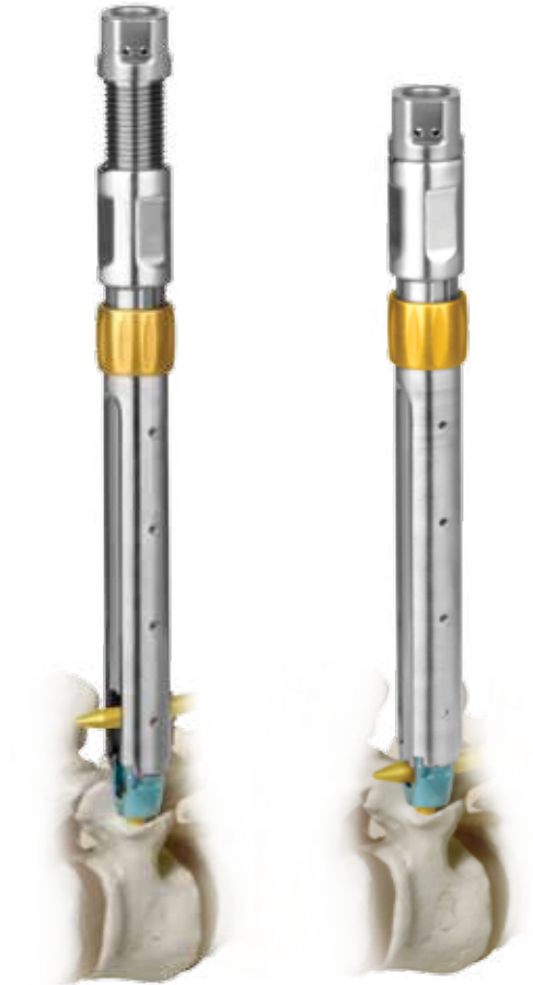
Integrated Rod Reduction